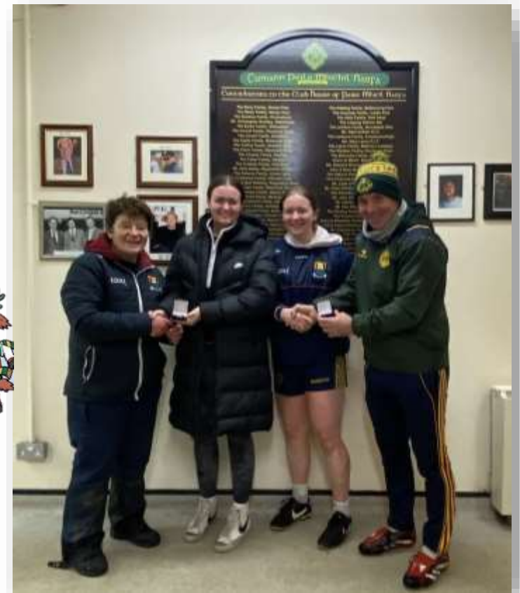
MUNSTER & ALL IRELAND MEDAL WINNERS